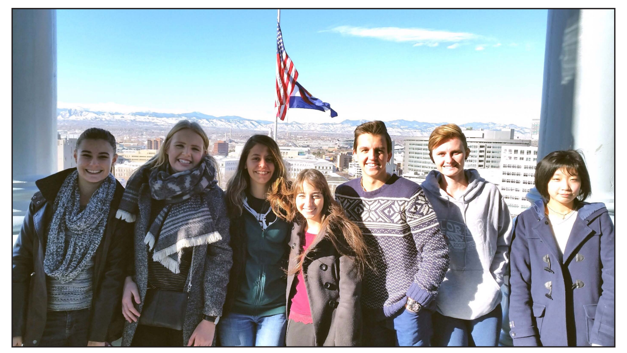
ASSE/WH students enjoy a Mile Hi view on a visit to the Colorado State Capitol in Denver, Colorado USA.

ASSE is very grateful to receive so many photos from around the ASSE and World Heritage world! Enjoy the following examples of all of the fun!