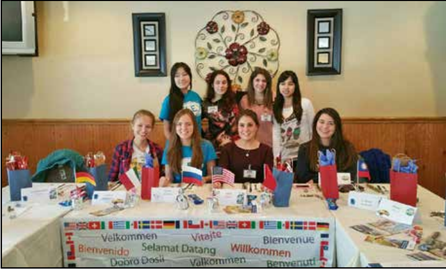
ASSE Exchange Students enjoyed the opportunity to share about their countries during the ASSE Area Representative Training Meeting in Pittsburgh, Pennsylvania, USA

ASSE is very grateful to receive so many photos from around the ASSE and World Heritage world! Enjoy the following examples of all of the fun!