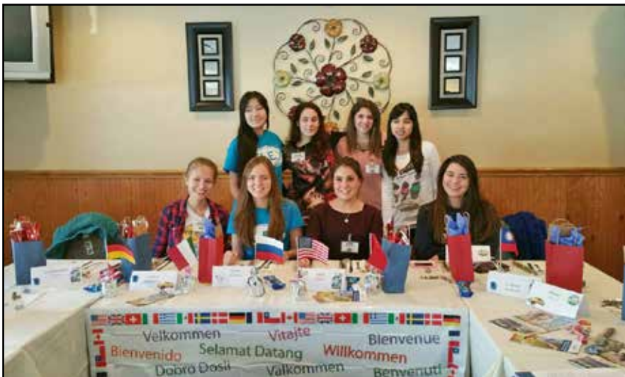
ASSE Exchange Students enjoyed the opportunity to share about their countries during the ASSE Area Representative Training Meeting in Pittsburgh, Pennsylvania, USA

ASSE is very grateful to receive so many photos from around the ASSE and World Heritage world! Enjoy the following examples of all of the fun!