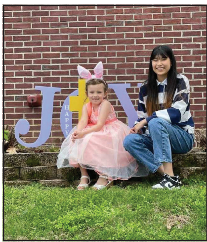
It's an Easter Celebration!

An Easter Egg Hunt with your host sibling is a wonderful way to make memories and enjoy the beautiful weather of spring. It's a great opportunity to bond with your host family and experience a fun and festive holiday tradition in a new country. As you search for hidden eggs filled with candies and surprises, you'll also be creating lasting memories and strengthening your relationships with your host family members. Plus, you'll have a chance to explore the local area and learn more about the Easter traditions and celebrations of your host country.