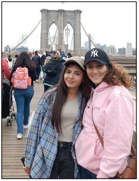
Ofelya in New York City