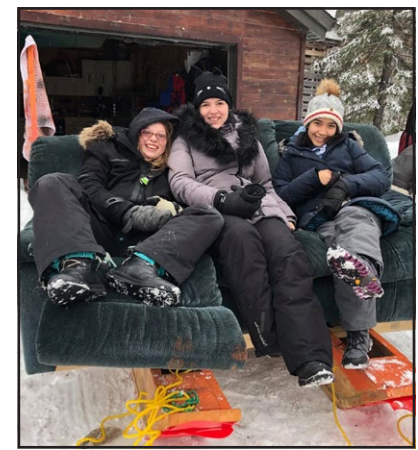
With host family