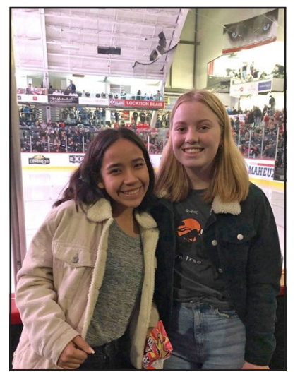
Enjoying a hockey game