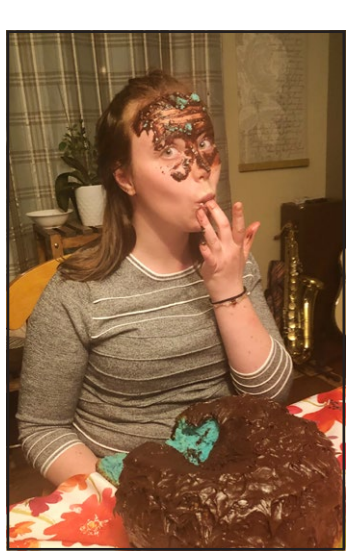
A Mexican tradition

I spent my first week in a camp with all the other exchange students that came to Quebec. It was the best way to start my exchange year. After I got to know my host family, we became more than just that. They treated me like a real daughter and I really appreciate them for that. I was in a double placement with a girl from Australia that became my best friend.