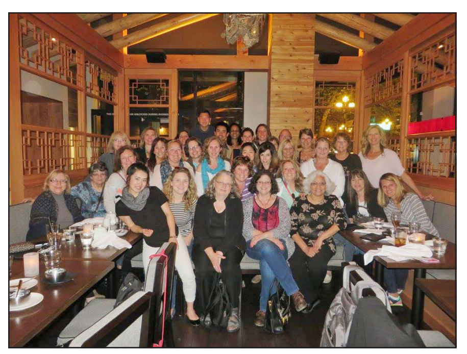
ASSE / WH Area Coordinators and Directors met in Seattle, Washington, USA April 7-10 for the Third Annual East Asian Workshop.