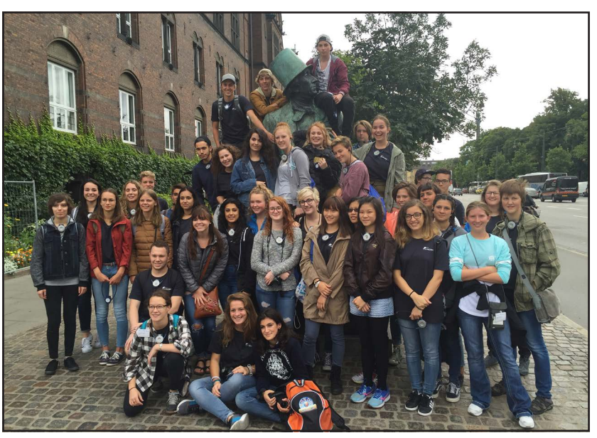
Exchange Students from ASSE affiliated offices in Australia, English Canada, Germany, Italy, Taiwan and USA gather for several days in Copenhagen, Denmark for orientation meetings before meeting their host families in Denmark, Norway or Finland.