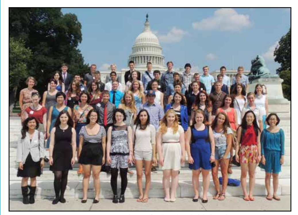
ASSE American Congress Bundestag Youth Exchange (CBYX) scholarship students pause in front of the U.S. Capitol in Washington D.C. USA

district; visited and learned about the U.S. Capitol/ National Monuments; met with U.S. Department of State CBYX program officers and had discussion sessions to prepare for the new cultural experience awaiting them in Germany.