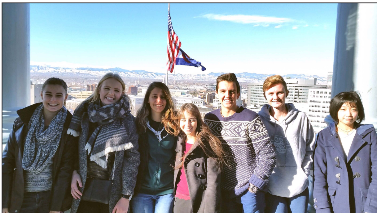
ASSE/WH students enjoy a Mile Hi view on a visit to the Colorado State Capitol in Denver, Colorado USA.

ASSE is very grateful to receive so many photos from around the ASSE and World Heritage world! Enjoy the following examples of all of the fun!