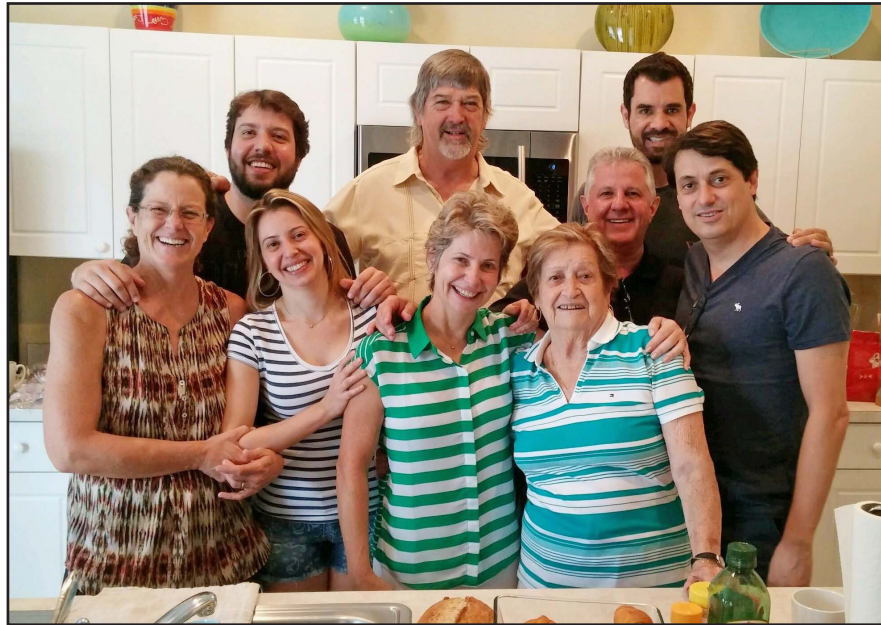
Mulcahy Family and the Mazotti Family meet up in Tampa, Florida USA for a happy reunion!