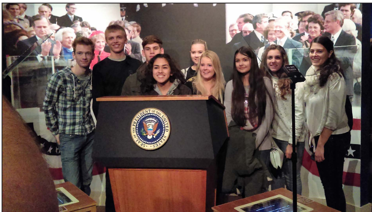
ASSE Exchange Students enjoy a visit to the Reagan Presidential Library in Simi Valley, California, USA.