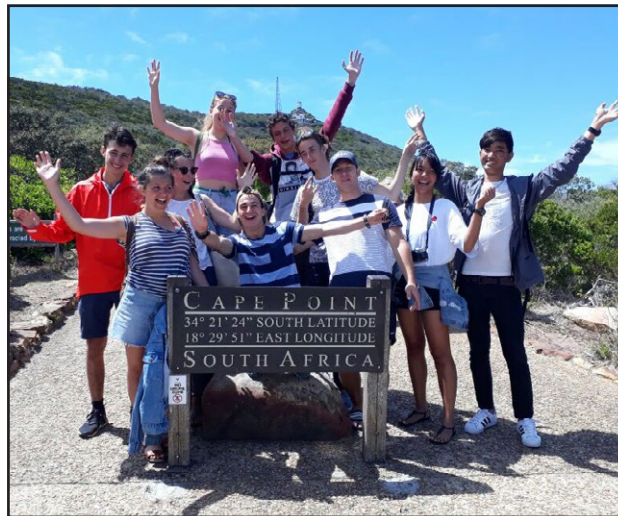
Calvin-Thomas South African students from France, Italy and Thailand enjoyed an outing to Cape Point, Cape Town South Africa