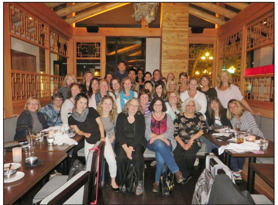
ASSE / WH Area Coordinators and Directors met in Seattle, Washington, USA April 7-10 for the Third Annual East Asian Workshop.