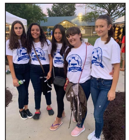
A part of the YES and FLEX scholarship program is volunteering. Each student completes at least 50 hours during their exchange year.