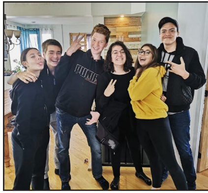
These ASSE French Canadian students had their first area meeting in Hebertville, Quebec. Looks like they had a great time!