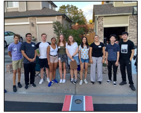
ASSE students placed in Colorado had a great time connecting and learning to play corn hole at their student orientation!