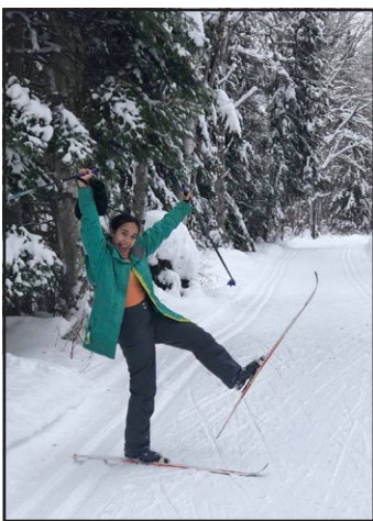
Cross country skiing