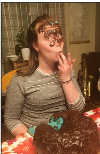
A Mexican tradition