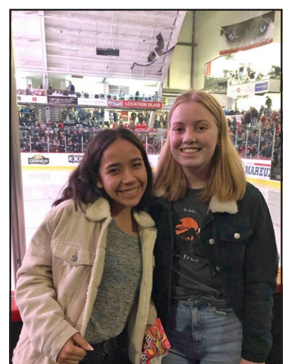
Enjoying a hockey game