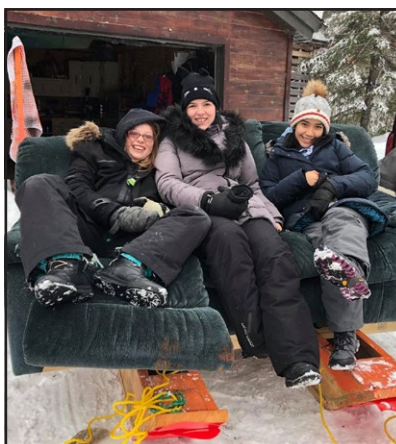
With host family