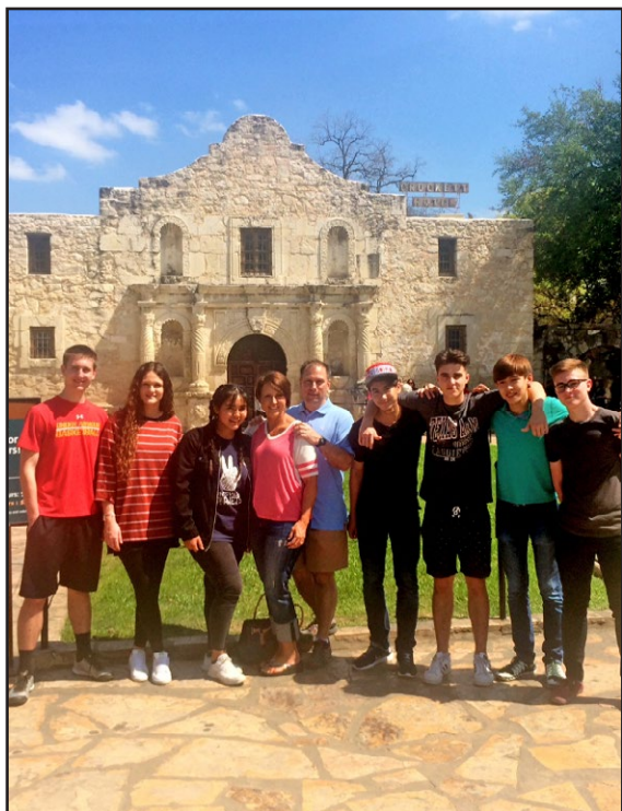
ASSE Exchange Students visited the Alamo in San Antonio, Texas USA during the weekend excursion that also included a visit to the Texas State Capitol in Austin, Texas USA.

ASSE is very grateful to receive so many photos from around the ASSE and World Heritage world! Enjoy the following examples of all of the fun!