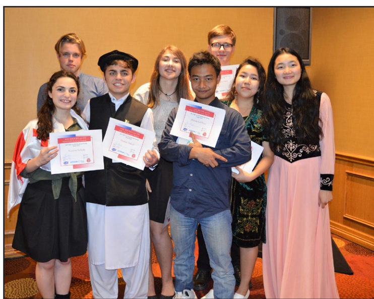
ASSE and World Heritage Area Representatives, Area Coordinators, Directors and FLEX, YES and CBYX students met in Austin, Texas USA to spend 2 days learning how to promote and support U.S. State Department sponsored grants program students. The FLEX, YES and CBYX students were the highlight of the meetings and informal discussions.